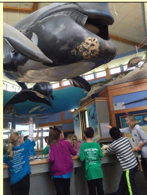
Watch out for flying whales!