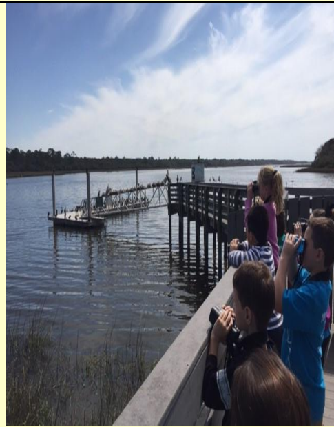
Using binoculars to see the birds!