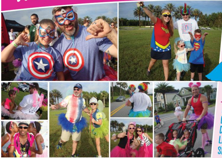
Produced by Ultimate Racing and The Easy Peasy Kids Fitness Foundation